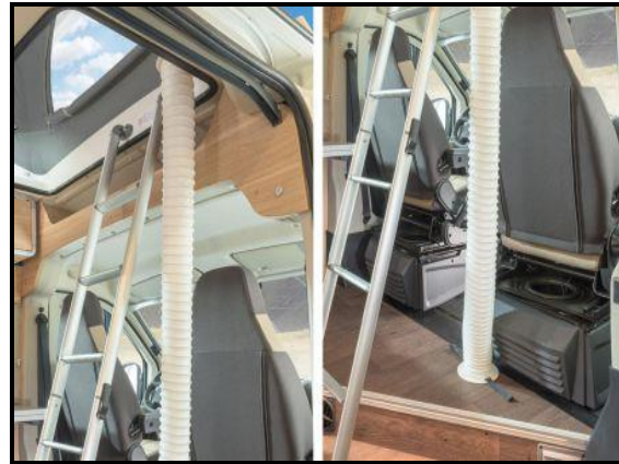
Pop-top roof heating system